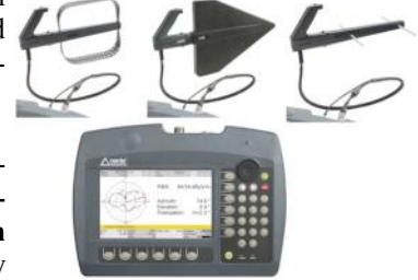
Narda Interference and Direction Analyzer

grated LNB control making it ideally suited for satellite communication systems.