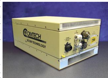
Comtech Xicom's XTSLIN-100X-B1

It is the perfect solution for military users who need high power, high efficiency compact solid-state amplification.