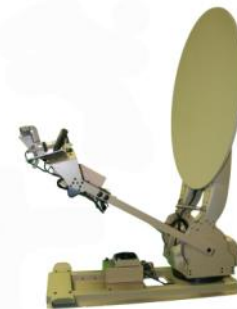
Auto-Explorer™ Transportable Satellite Terminal

Features include satellite auto acquisition function, replaceable modem & power supply, and a graphical user interface that simplifies the operation. Single, Dual, Tri-band (X, Ku, Ka band) configurations are optional. Other options include outdoor modem configuration, baseband enclaves (SIPR, NIPR), and IATA compliant for checked baggage. Additionally we offer the option to eliminate L-band cabling and support select iDirect, HNS and CEFD modem products.