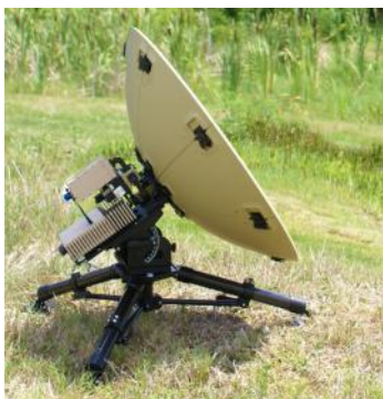
Cobham Explorer 3075

The Cobham EXPLORER 3075 manual point flyaway VSAT system is a lightweight, rugged, highly portable, and modular mobile terminal capable of X, Ku and Ka band operation. Its user-friendly design allows operators with minimal satellite experience to access broadband network services within minutes. Transport packaging consists of a single airline-checkable case. Cobham SATCOM, as an official launch partner of the Inmarsat Global Xpress® (GX) network, is offering models of the EXPLORER 3075 configured specifically for operation on both the GX commercial (1GHz) and wide-band (2GHz) services. Cobham SATCOM offers a diverse array of turn-key satellite terminals that fulfill critical communications needs and reduce system configuration requirements for end users. Systems are available as manual or auto-deploy configuration, and are organized in drive-away, fly-