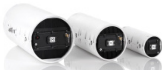
Mission Microwave X-, Ku-, and Ka-band GaN BUCs

Mission Microwave Technologies demonstrates revolutionary design for RF and microwave electronics, supporting ground-based, airborne, and space-based applications. Utilizing the latest in semiconductor technology, Mission Microwave's focus is to optimize the size, weight, and power (SWaP) for these critical applications, while providing its customers with the best possible reliability. Mission Microwave sets the 'new standard' for performance and reliability.